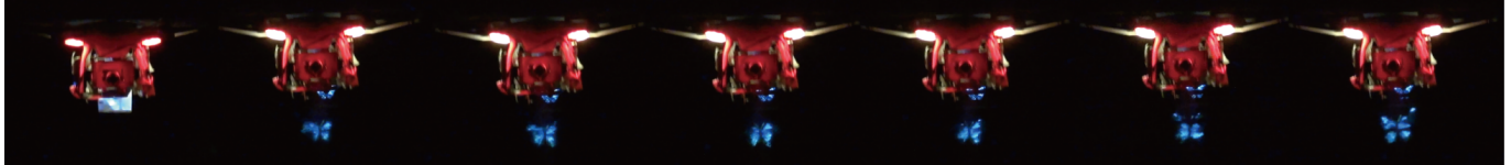
Figure 3. Floating screen with projection (showing a morpho butterfly) under the drone (DJI Phantom 2; DJI Co., Ltd.).

petroleum gas (LPG). Because these are high-volatility ingredients, they do not remain on surfaces of objects like floors or walls. Many typical off-the-shelf sprays like antiperspirant sprays tend to include many ingredients and additives. Some of these ingredients remain on surfaces of objects and complicate the cleanup after using the system. Because audiences will experience unpleasant sensations in such case, we employ the spray for cooling human's body.